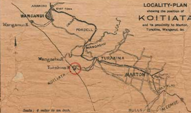
LOCALITY-PLAN showing the position of KOITIATA and its proximity to Marton, Turakina, Wanganui, &c.

Motor vehicles can now be driven to the sections, but, owing to patches of loose sand, motor vehicles can at present only be taken to within about half a mile of the town.