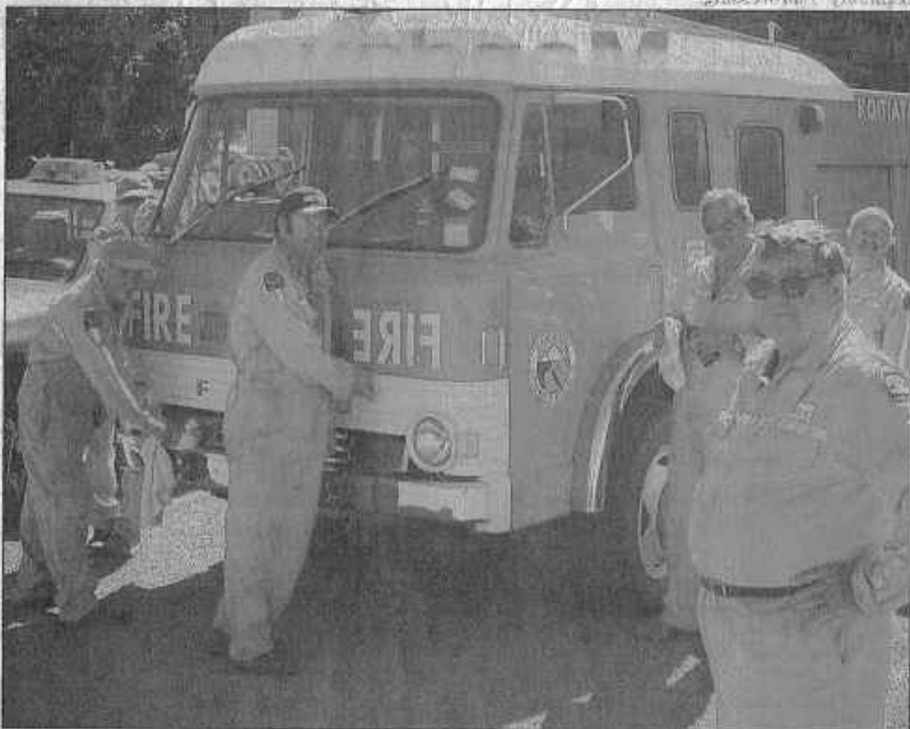
DSCN0086