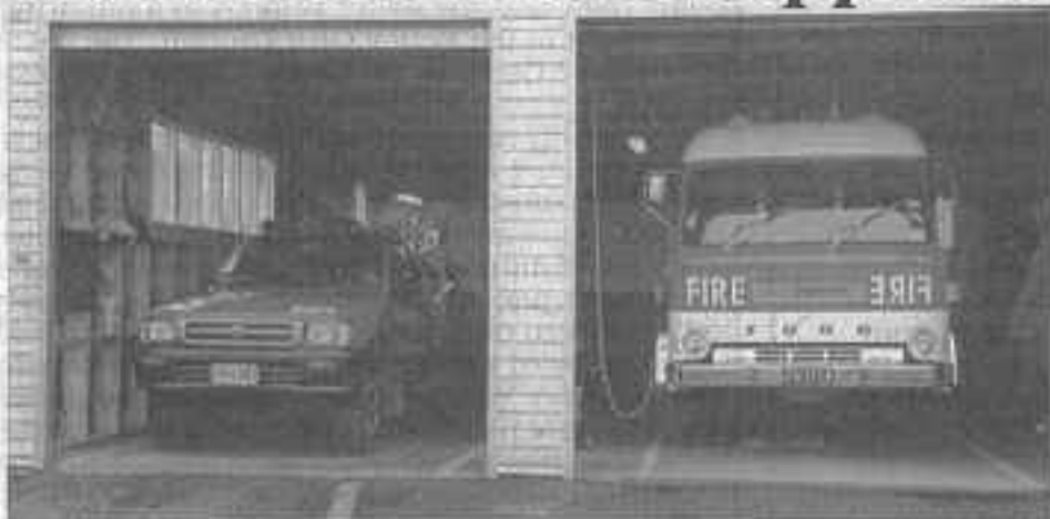
The Koitiata Rural Fire Engines in thier new housing