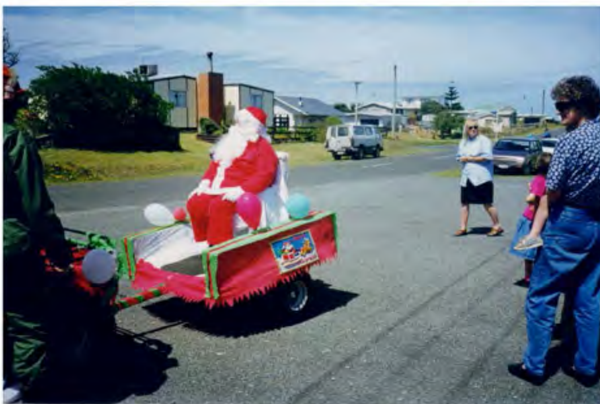
Xmas Parade 1997