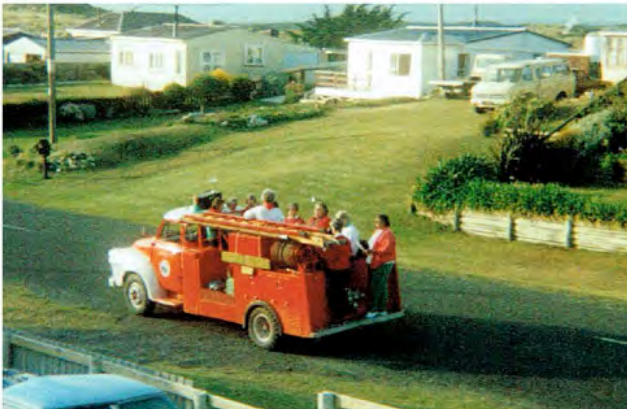
Xmas Carols 1991