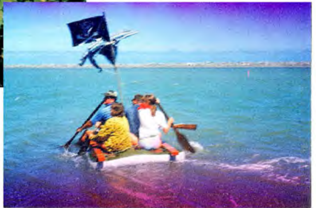
Raft Race 1995