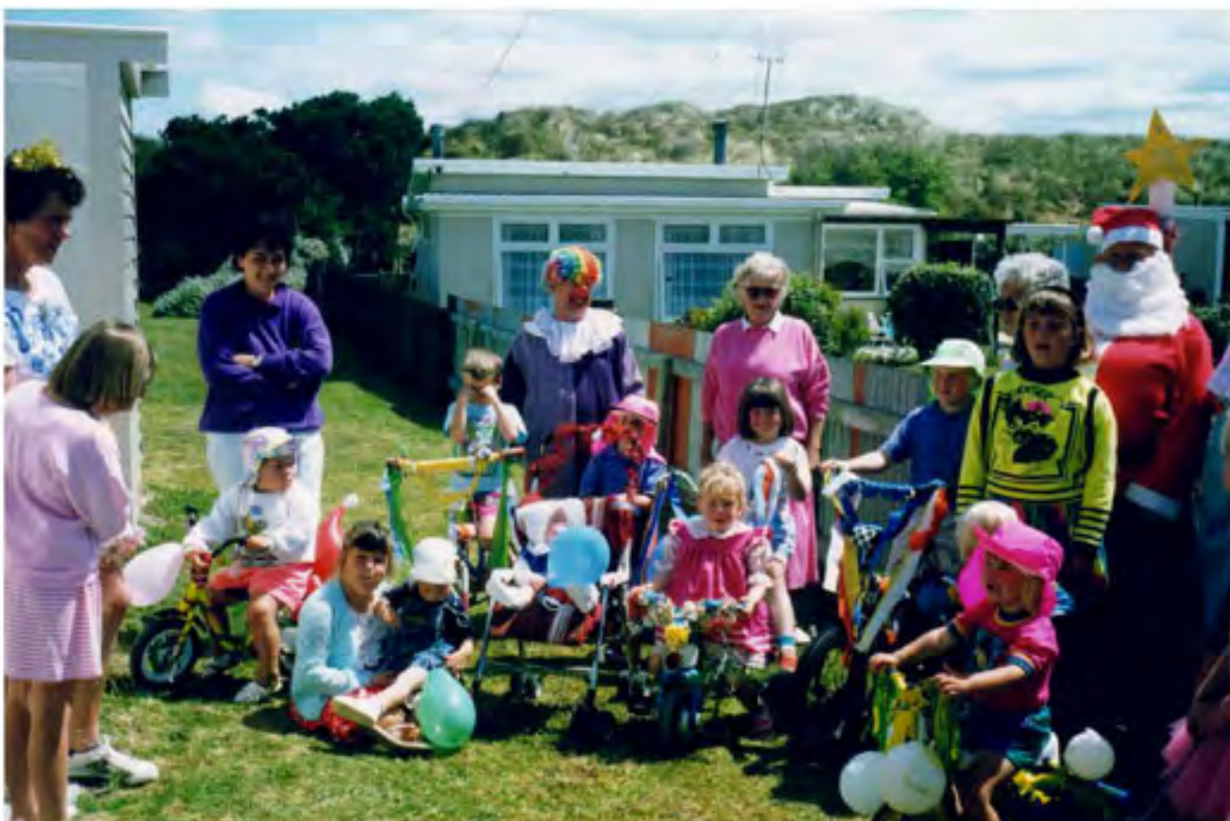
Xmas Parade 1991