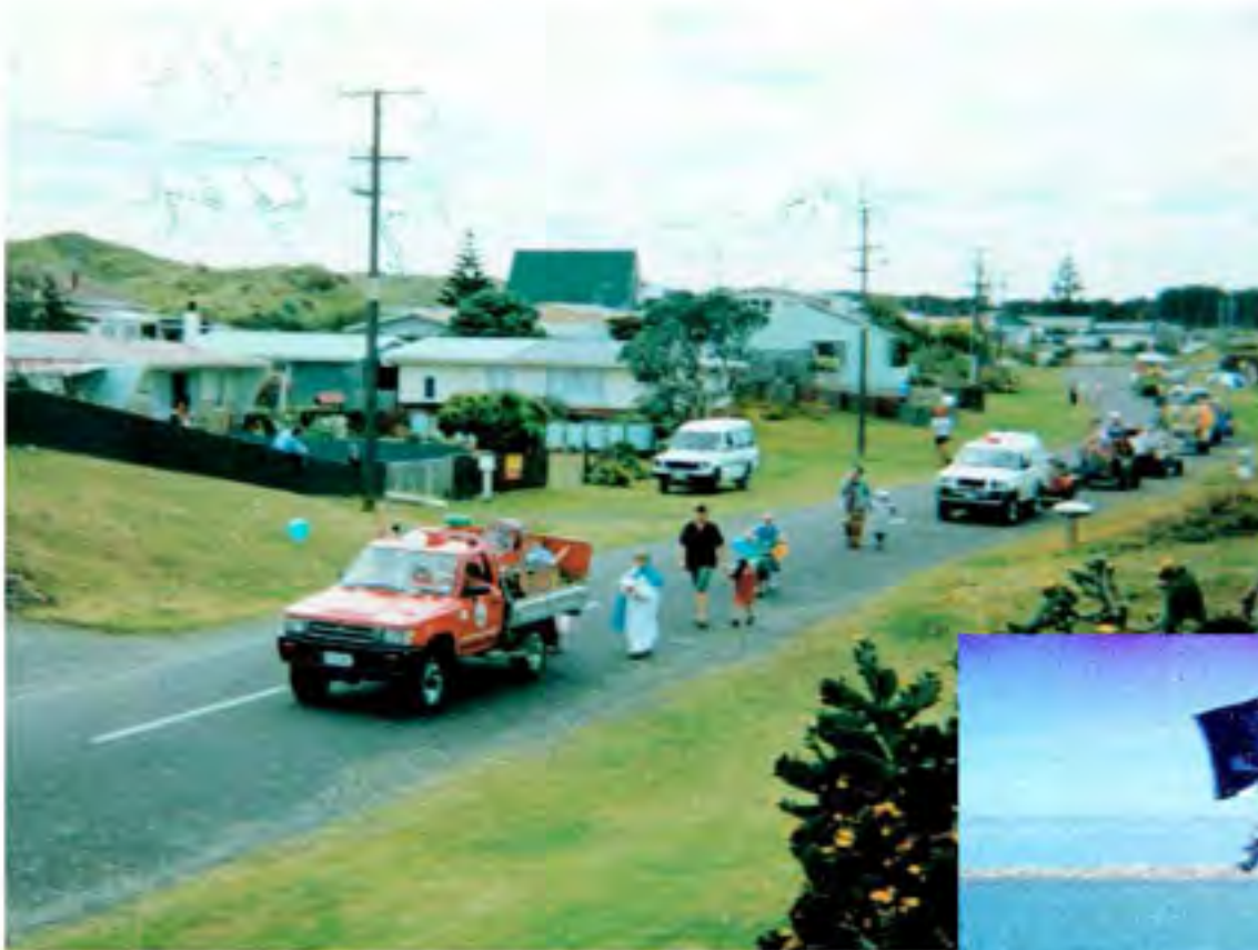
Xmas Parade 1994