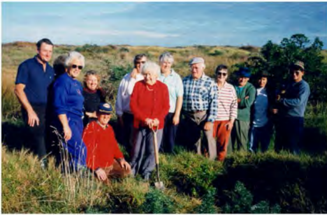
Beginning of the tree planting on beach side of village 1994