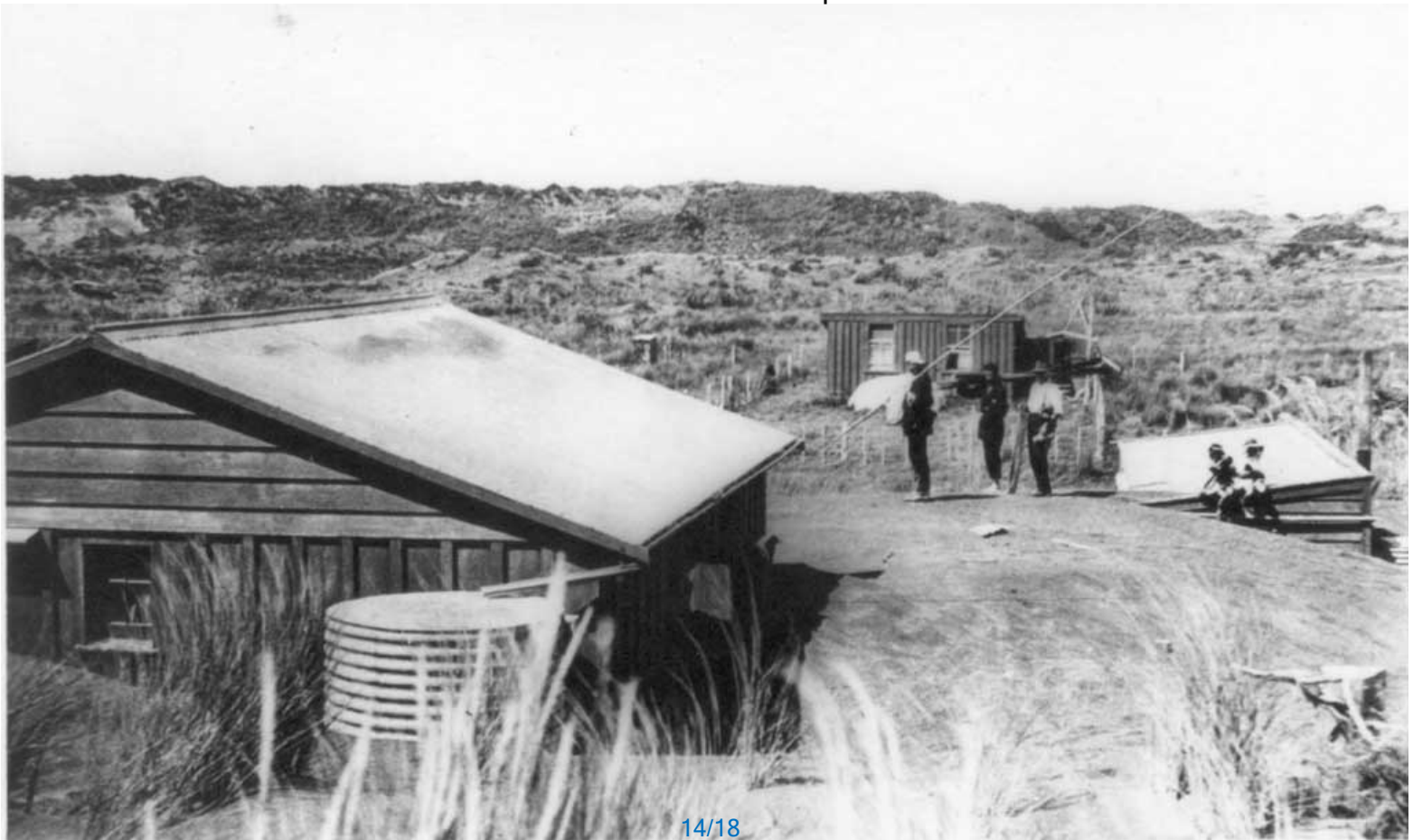
Below: 1920's: Buildings being buried by the sand drift. Precise location unknown, probably somewhere in the area of the sea end of Wainui and Rapaki.