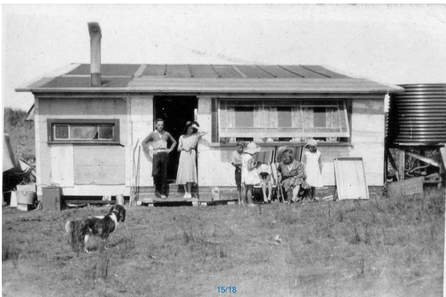
Below: 1930's: This is the bach above, relocated to 68 Wainui from 25 Rapaki street.