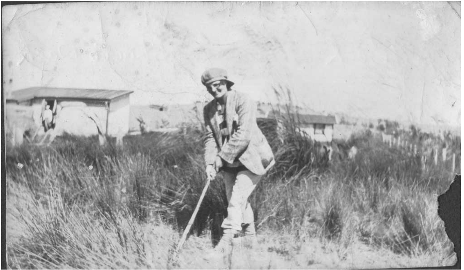
Above: 1920's: Looking towards the sea from the Omanu street area, the bach on left is at 25 and on right at 27 Rapaki street.