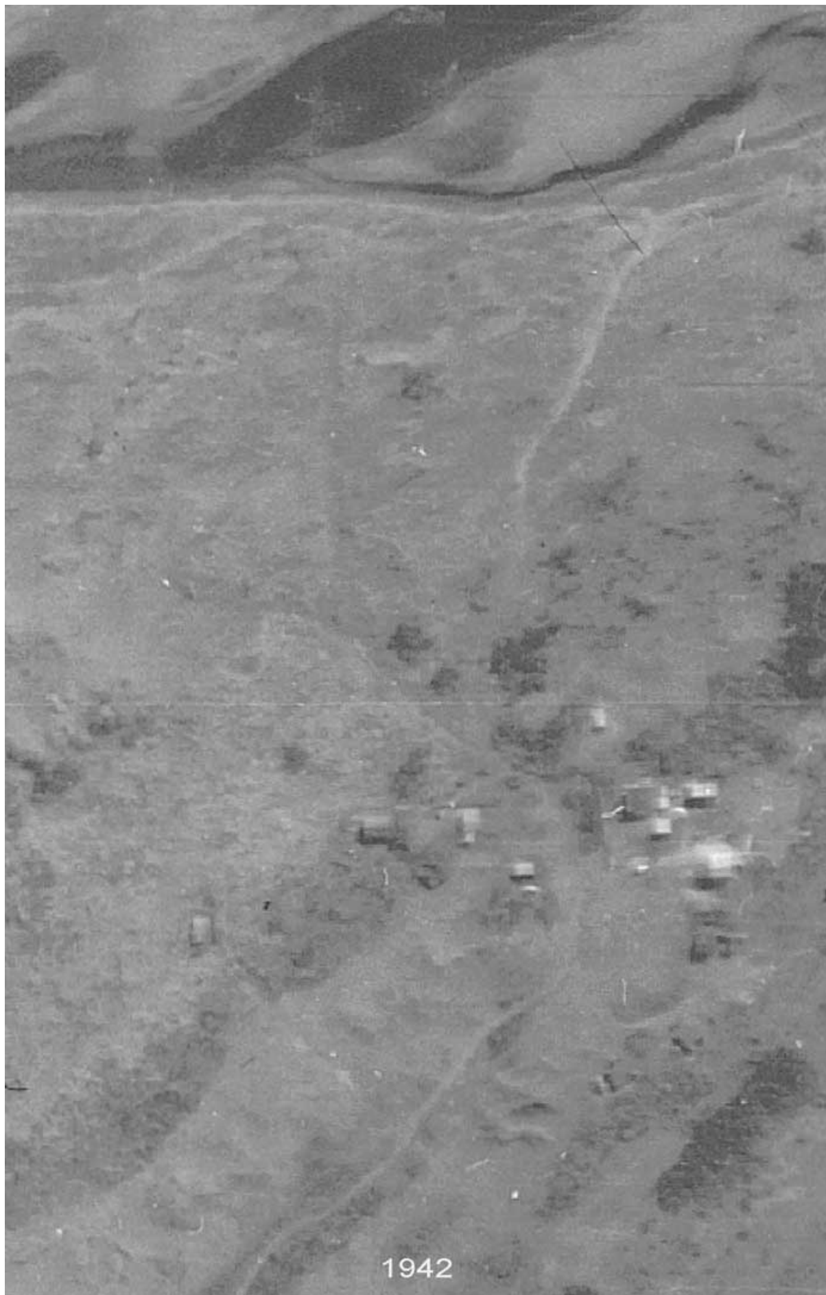
The aerial photo above was taken by RNZAF in December 1942. The buildings shown are all located in the Wainui/Omanu street area; no buildings existed in Rapaki street at that time. The track going into the village from the bottom of photo is now Wainui street.