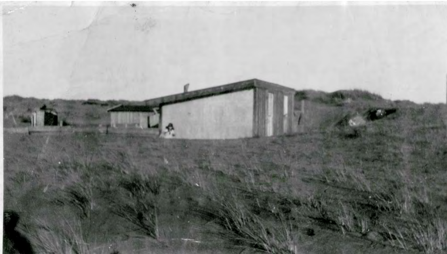
Above: 1920's: Wainwright's bach at 25 Rapaki street, looking south with the sea to the right side of location. Bach was relocated to 68 Wainui street late 1920's or early 30's.